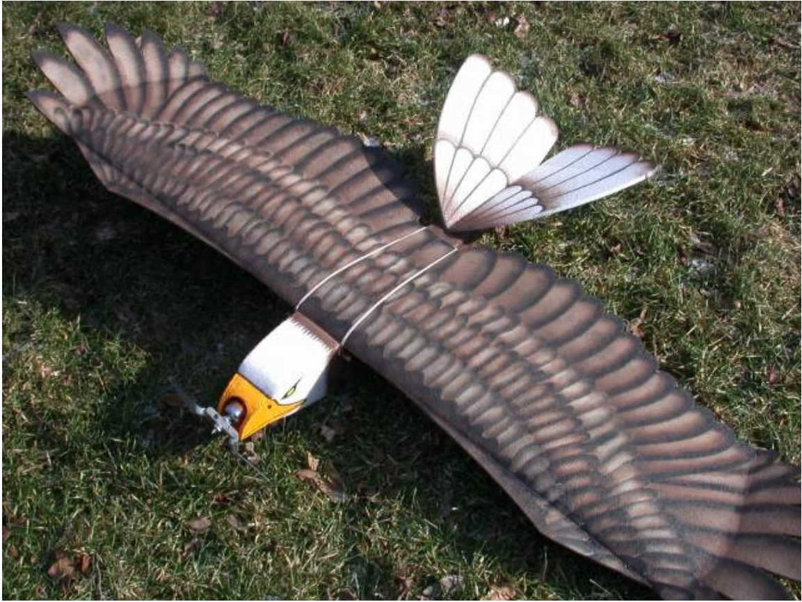
Roy Bourke's EPP Eagle, ready to soar over the COGG Field this summer